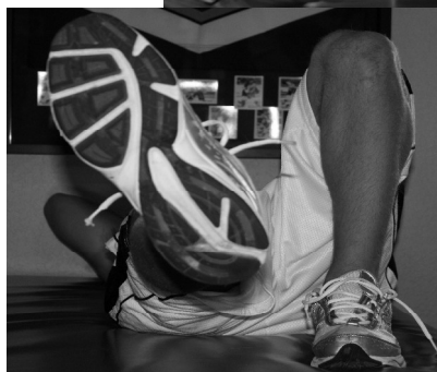
Above: Toes pointed up